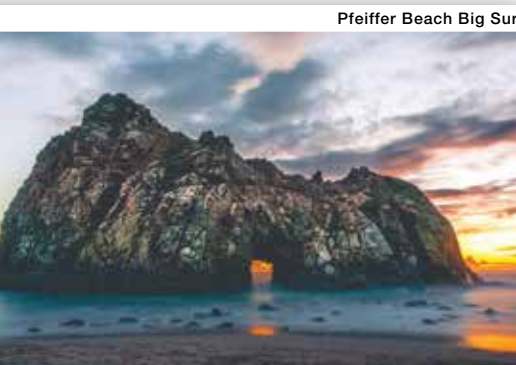
Pfeiffer Beach Big Sur