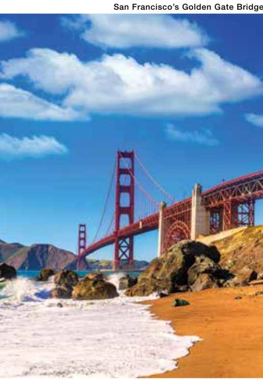
San Francisco's Golden Gate Bridge