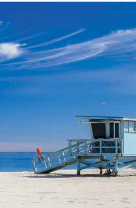
Santa Monica Beach