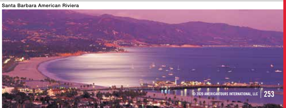
Santa Barbara American Riviera